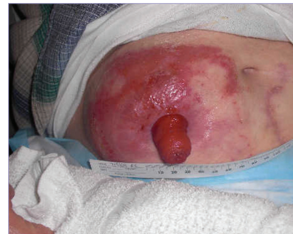
Patient B - before cyanoacrylate