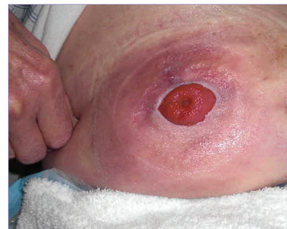
Patient B - after cyanoacrylate