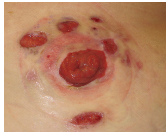
Patient A - before cyanoacrylate